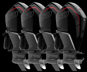
Quad Mercury 450 (black or white)