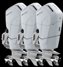
Trip Mercury 600 (black or white)