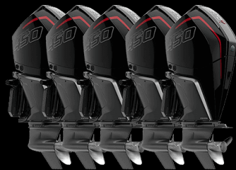
Quint Mercury 450 (black or white)