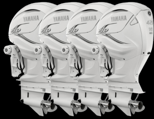
Quad Yamaha 425 (grey or white)