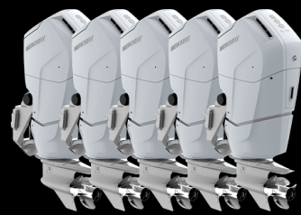
Quint Mercury 600 (black or white)