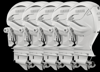
Quint Yamaha 425 (grey or white)