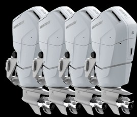
Quad Mercury 600 (black or white)